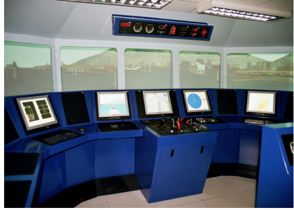
The course makes use of realistic scenarios developed in full mission bridge simulator at FORCE Technology in Lyngby