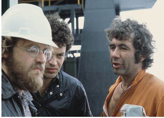
Human Factors aspects play a significant role in most incidents or accidents