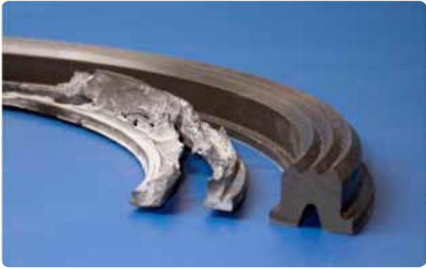
Decomposed elastomer seal