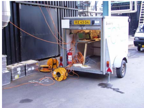
Measuring station where detector cables are connected to recording instrumentation. Detector recordings are displayed online.

Niels Hald Pedersen, tel.(direct) +45 43 26 75 14, nhp@force.dk Steen Genders, tel.(direct) +45 43 26 74 89, stg@force.dk Piet Jansen, tel.(direct) +45 43 26 72 62, pj@force.dk