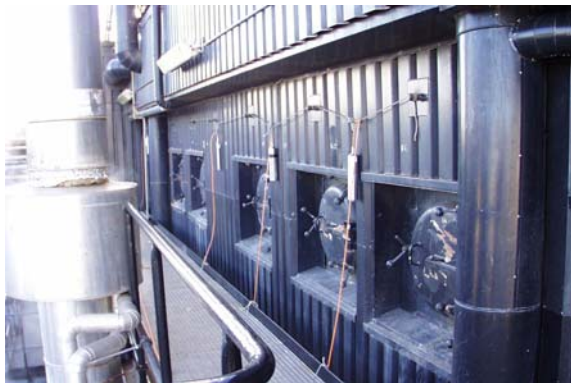
Detectors mounted outside insulation panels

A network of radiation detectors mounted outside on the boiler construction maps flow and circulation characteristics. FORCE Technology is licensed to perform such measurements on the basis of approved safety procedures.