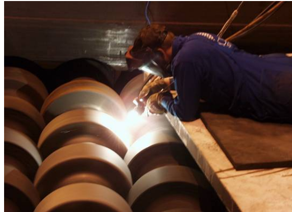
Repair by thermal spraying of large and costly application on-site