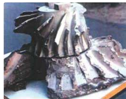
Totally destroyed compressor wheel

FORCE Technology is a member of both the CIMAC Denmark (The International Council of Combustion Engines) work group and WG 10 Users. We became members of WG 10 in June 2010, during the CIMAC congress in Bergen, Norway. The group is a dialogue forum among users and engine manufacturers. We will therefore obtain extensive knowledge of a number of operation related problems, providing us with the opportunity to offer our assistance and at the same time share our knowledge, through e.g. case stories.