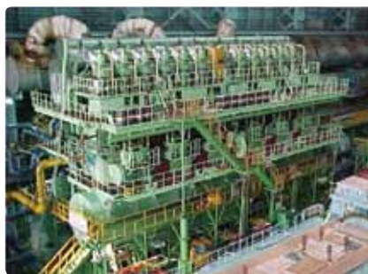
Engine at shop test

Marine Engineering often directs our attention to vessels and the shipping industry, but Marine Engineering actually also includes FPSO (Floating Production Storage and Offloading) and oil rigs, as the applied machines and equipment are identical to a large extent.