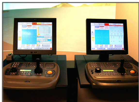
The trademarks of DMI's training are flexibility and tailor-making. DMI has a vast experience in organizing course packages to suit different competence levels.