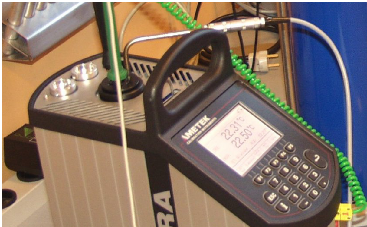
Calibration of insert sensor