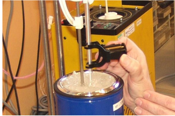
Calibration of glass thermometer