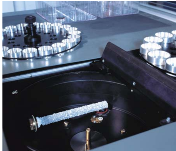
An anode with coating in the test chamber