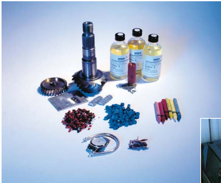
Various test samples