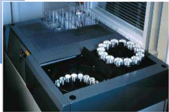
FORCE Technology's XRF equipment