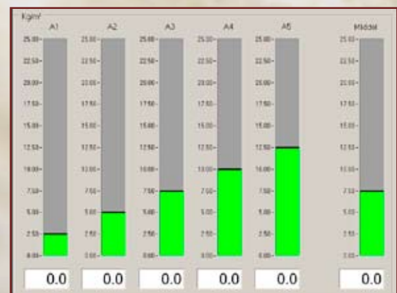
Visualisation of line control information. Distribution and average area-weight.

During the whole warranty period, you will have full access to FORCE Technology's team of professional specialists who are ready to help you with any problem that may occur. After the warranty period, we can adjust our level of service to your specific needs and demands.